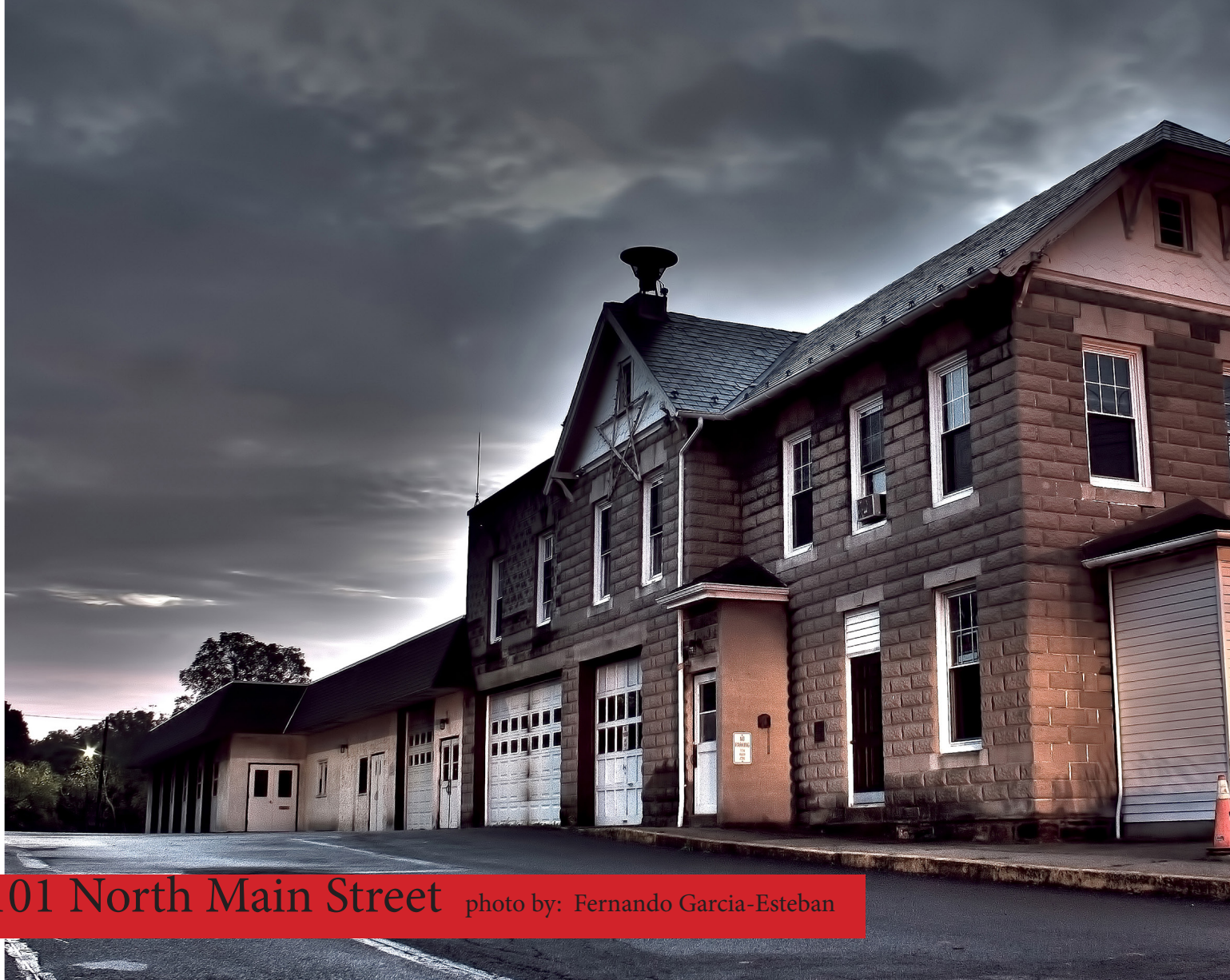
101 North Main Street