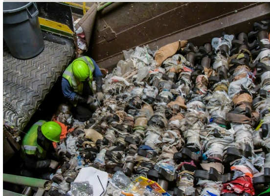
Workers removing tangled plastic bags from equipment.