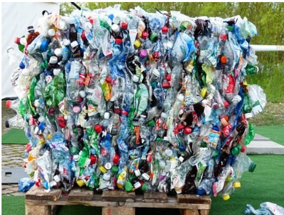
Baled plastic bottles to be sold.